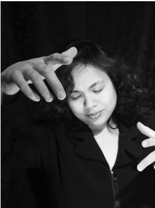
Self-portrait by Ayn Inserto